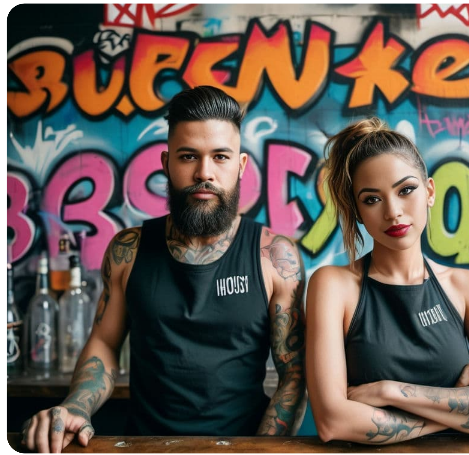
Houston's Finest: Building a Rewarding Career in Bartending